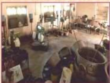
Food Processing Unit & Mushroom Spawn Production Lab