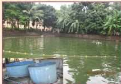
Fishery Unit with Hatchery