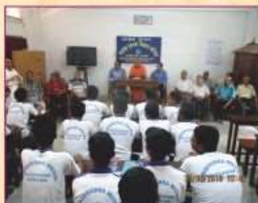
Class Room 1