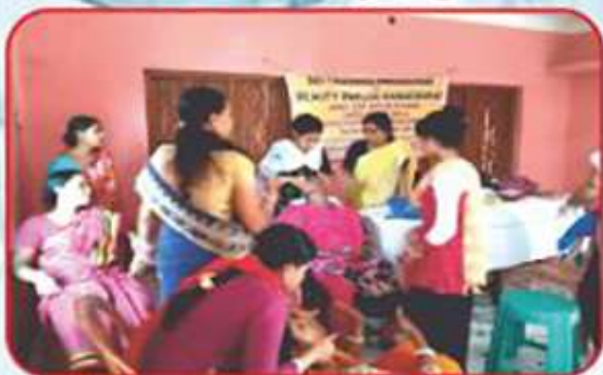
Beauty Parlour Management