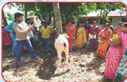
Dairy Farming & Vermi-compost Making