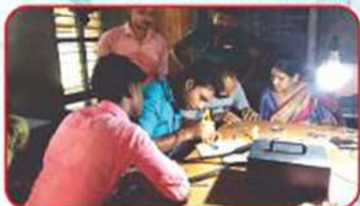
Cellphone Repairs & Servicing