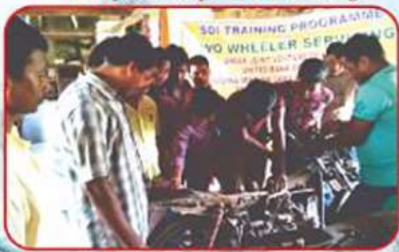
Two Wheeler Repairing