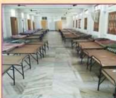
Dormitory for Farmers'