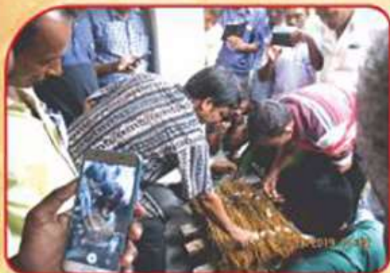
Mushroom Cultivation Practical