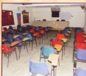
Class Room 3