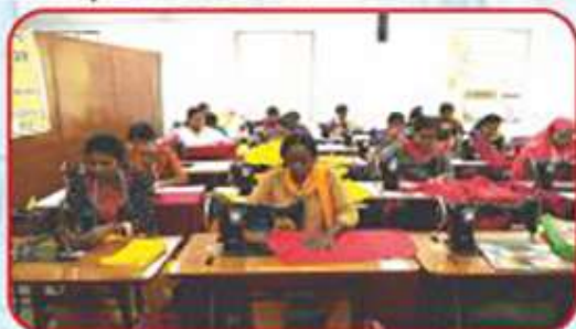
Dress Design for Women (Tailoring)