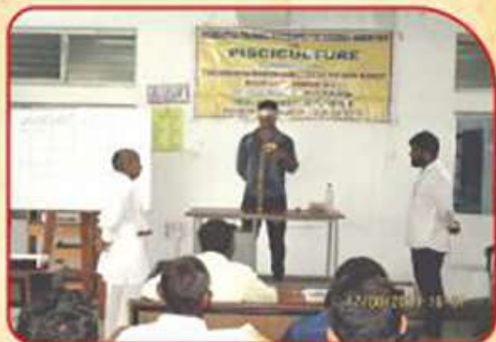
Tower Building Game