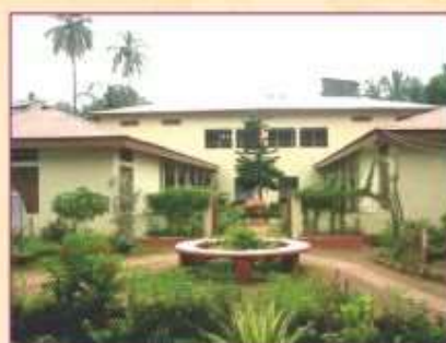
Hostel for REDP Students'