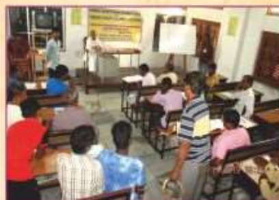
Class Room 2